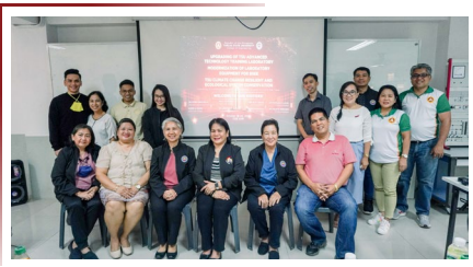
TSU bags IZN award in CHED ICONS 2023