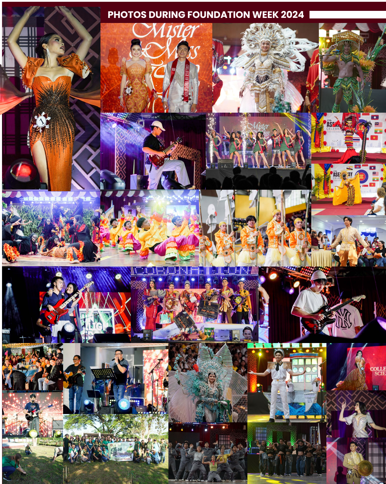
PHOTOS DURING FOUNDATION WEEK 2024