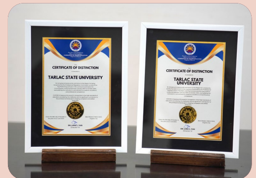
TSU recognized by CHEDRO 3 for board exam performance, topnotchers