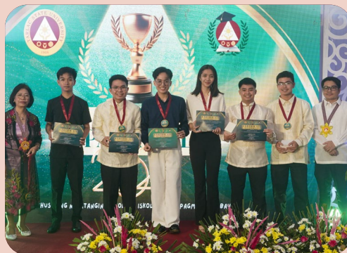
TSU honors scholars, benefactors in pioneering Gawad Parangal