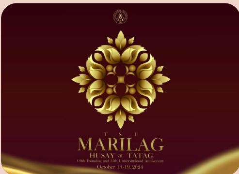
TSU ensures 'husay at tatag' in 2024 Foundation Week celeb